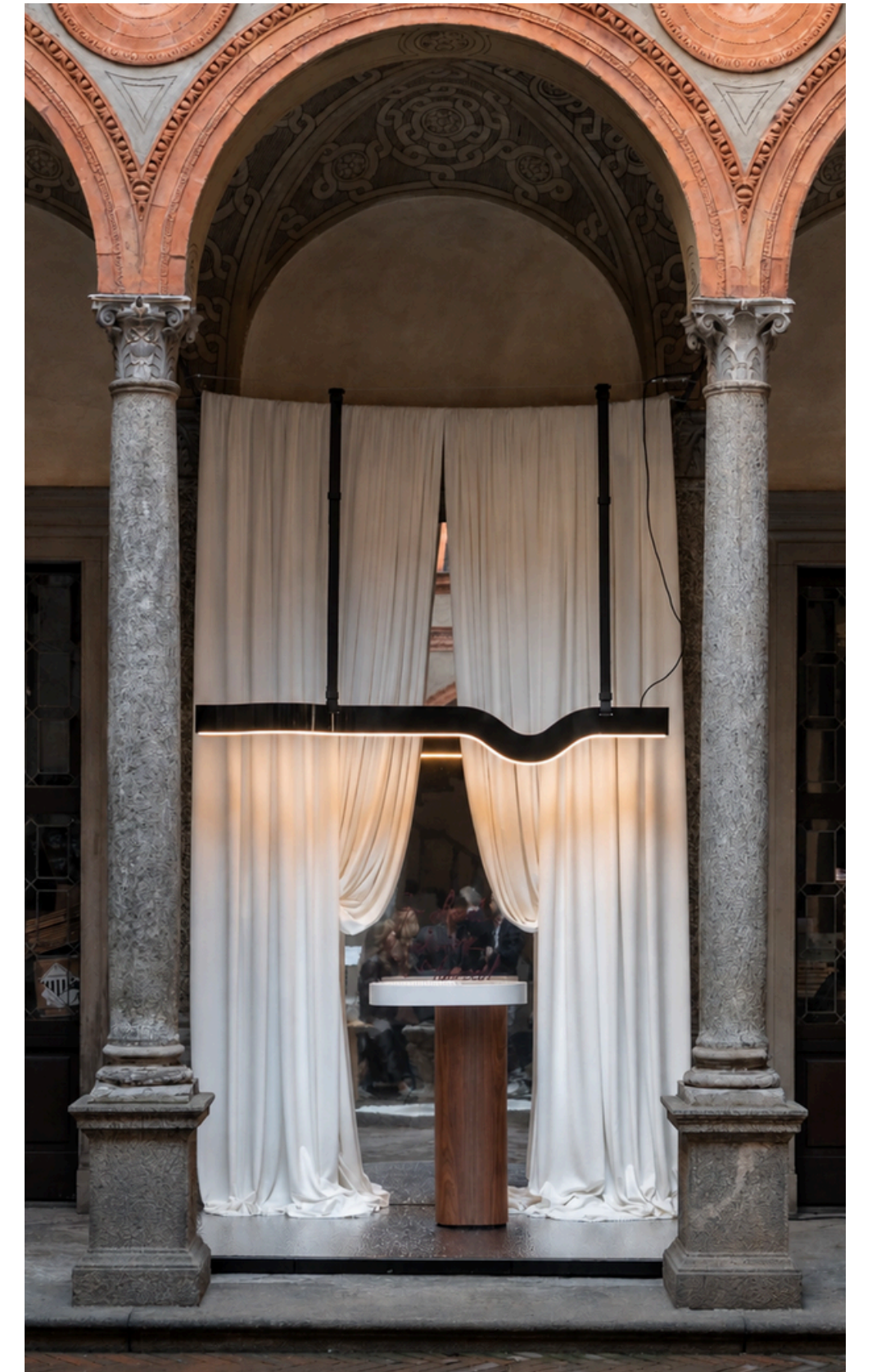
WOOD, METAL, RESIN, COPPER, MARBLE, LEATHER AND CORIAN BECOME CARRIERS OF FORM, GESTURE, AND TACTILE PRESENCE.